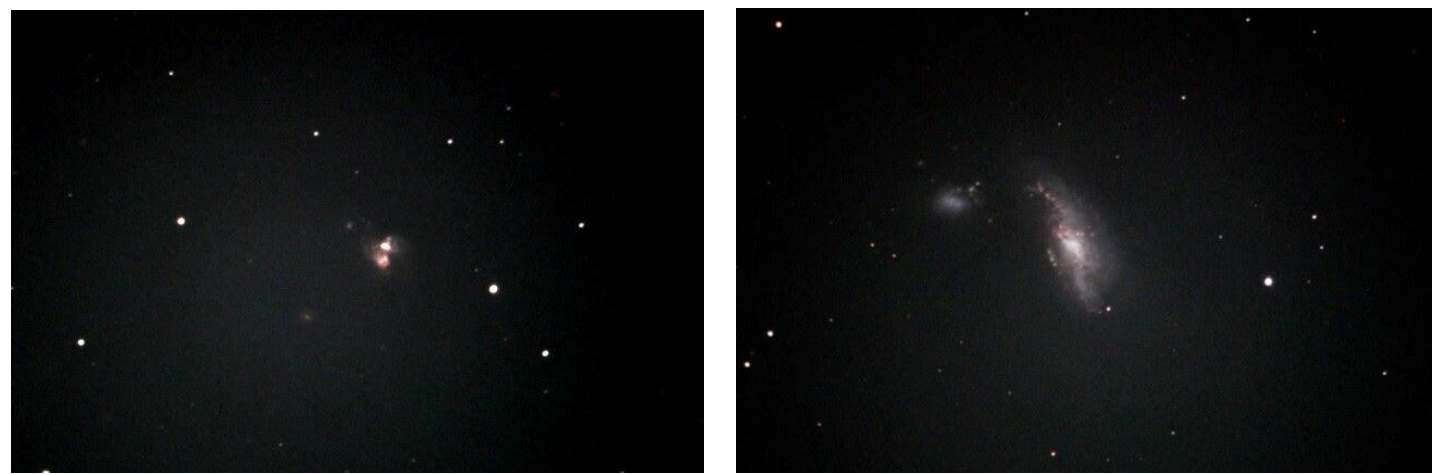
(Arp296 & 299, and Arp269, same telescope & camera info as above)

During my observing of Arp269, a number of light hazy bands began to build to my south and began pushing northward. Shortly after midnight, as I was positioning the telescope & main camera for the next object, I noticed that the view in the wide-field Canon piggybacked lens started going soft. Looking over to the allsky camera monitor, I realized that the clouds that had been hanging to the south had suddenly boiled over to the north. I was clouded-out!!