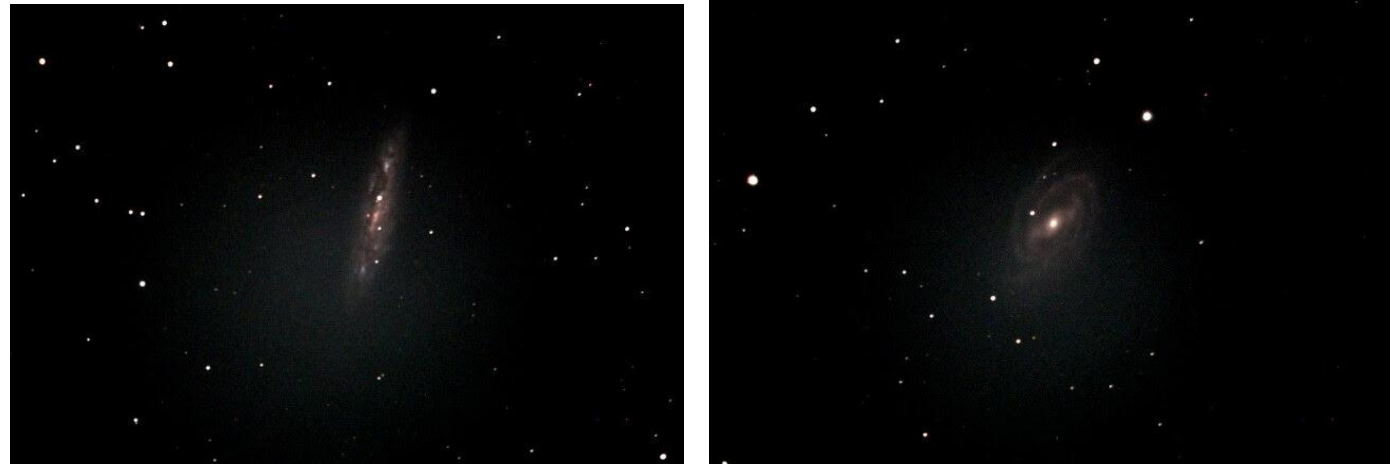
(8" SCT optical tube @f6.3 on the Atlas GEM, with the ASI294MC camera & L-Pro filter, ROI=2072x1410 then cropped, 120 second exposure for a total of 30 minutes)

So I decided to head North to Ursa Major and hunt Arp Peculiar galaxies nested around the bowel of the big Dipper. But first, I stopped by a couple of bright Messier galaxies: M108 & M109.