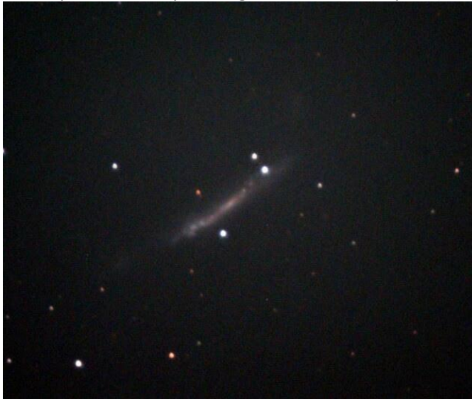
(same telescope, camera, and exposure as above)

I also observed spindle galaxy - NGC3432 (Arp206) showing tidal effects off of either end of the spiral, and over to the Leo Triplet for a deeper image of NGC3628 (Arp317):