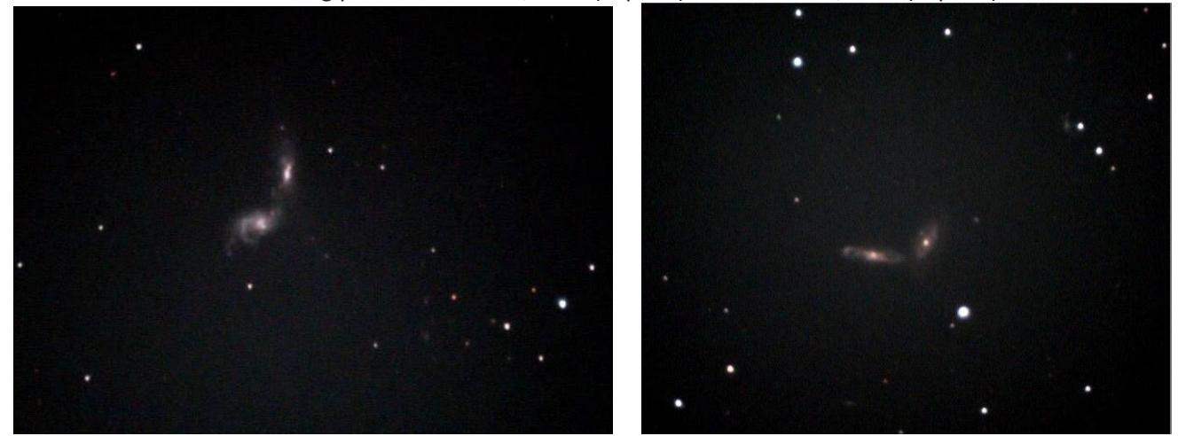
<same telescope & camera info as above, 120 second exposure for 30 minutes)

I then headed over to the Leo/Leo Minor region of the sky to hunt additional NGC/Arp galaxies. These included the interacting pairs of NGC3395/3396 (Arp270) and NGC3786/3788 (Arp294):